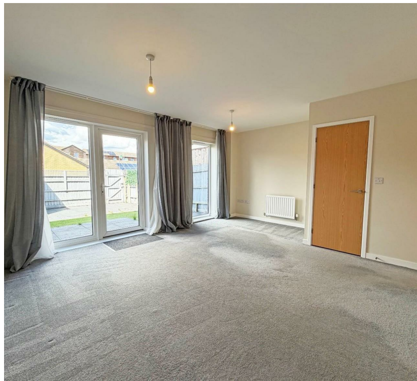
20 Greenwood Road Hampton Vale PE7 8JX